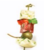
Antipasti Pick Artichoke, Caper Berry, Salami Chunk, Red Pepper, Parsley Garnish, Sharp Provolone Cheese, Olive Oil