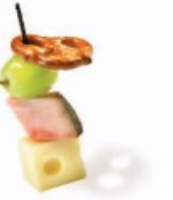
Baby Pick Baby Swiss Cheese Cube, Ham Chunk, Green Grape, Topped with a Pretzel Knot