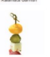
Deli Pick Sausage, Pepper Jack Cheese, Sweet Pickle, Cheddar Cheese Curd or Cube