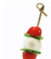
Caprese Pick Grape Tomato, Basil Leaf, Fresh Mozzarella Cheese Ciligene

Serve on a Black Party Tray. Min 6 per variety. 6 picks $15.99