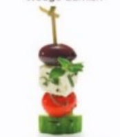
Greek Salad Pick Cucumber Chunk, Grape Tomato, Feta Cheese Cube, Pitted Kalamata, Olive Oil Drizzle, Oregano Garnish